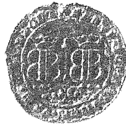
Fig.42 German seals - 315 Mansfeld, 316 and 319 Wesel (with parallel from Bocholt), 320 unidentified German town